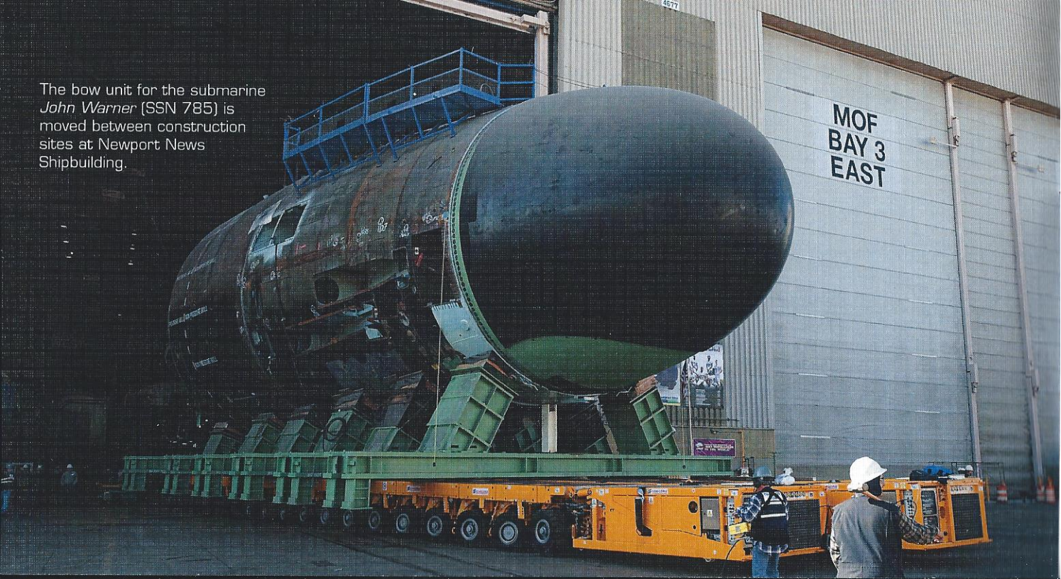
The bow unit for the submarine John Warner (SSN 785) is moved between construction sites at Newport News Shipbuilding.