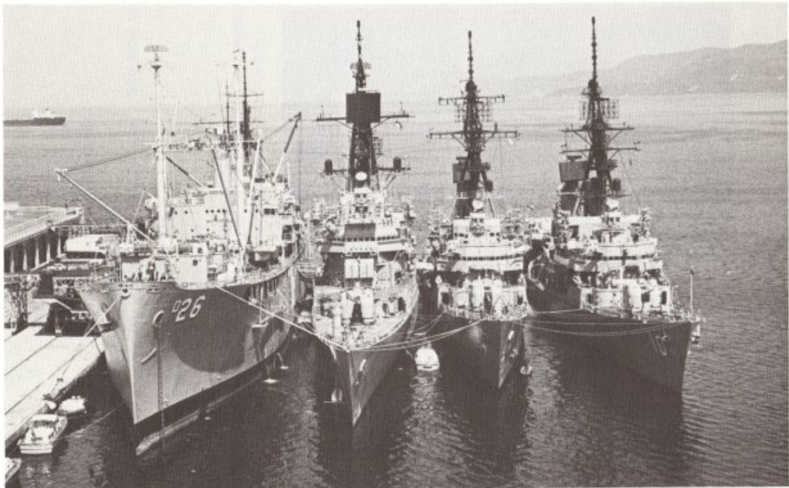
SHENANDOAH MOTTO: "WE KEEP DESTROYERS FIT TO FIGHT"