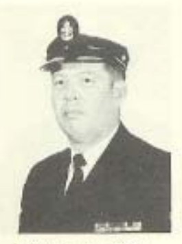
BRC H. W. BYRD Repair Department