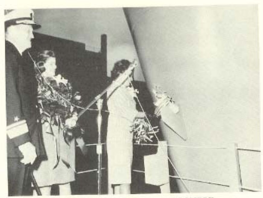
THE TRADITION OF THE SPONSOR

Included among his decorations are the Legion of Merit, Distinguished Flying Cross with Gold Star, the Air Medal with seven Gold Stars, the Vietnam Service Medal and the Republic of Vietnam Campaign Medal with Device.