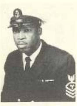
MMC E. BRIDGES Repair Department