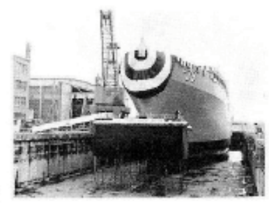
CHRISTENING 16 SEPTEMBER 1966