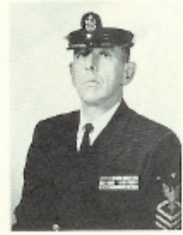
HMCS R. W. BORDNER Medical Department