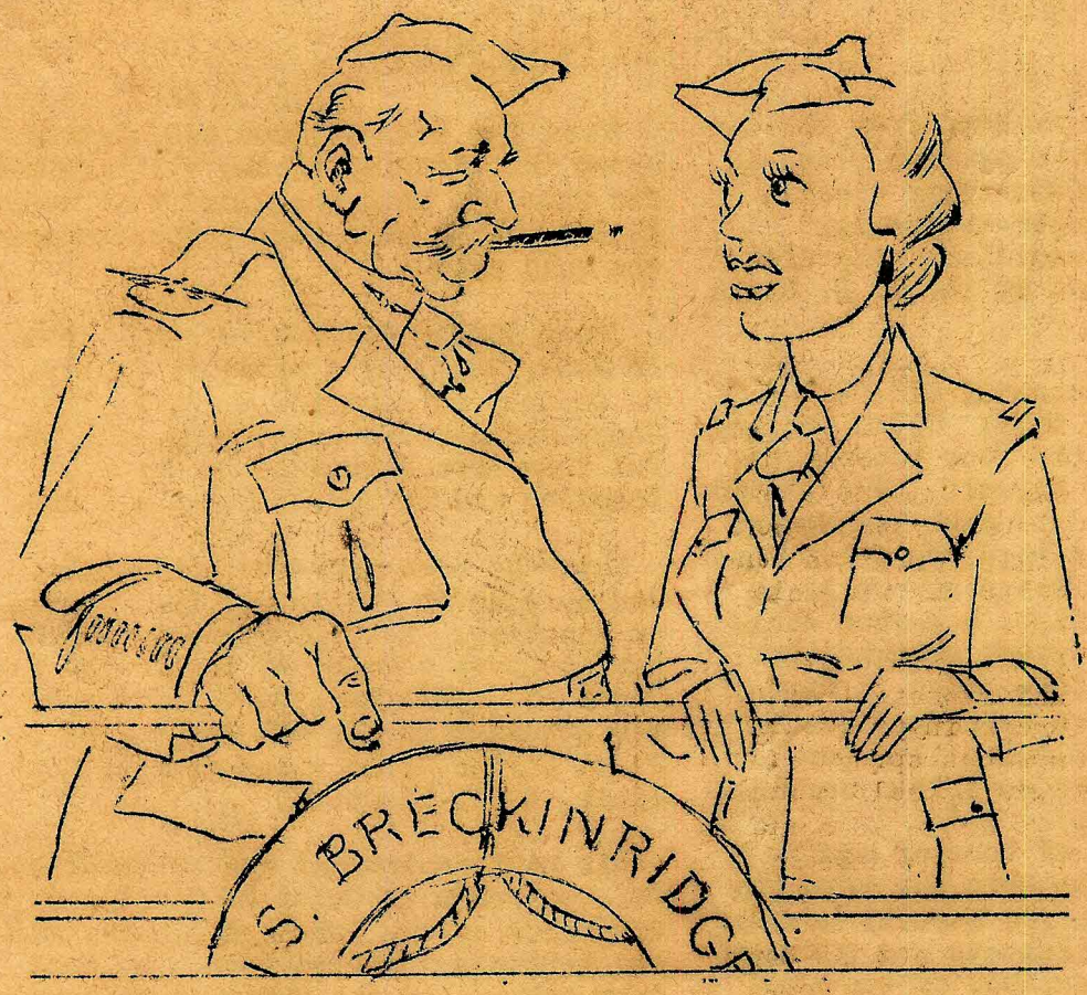
"Think, My Dear, When I Came Over I Was Only a Pfc."