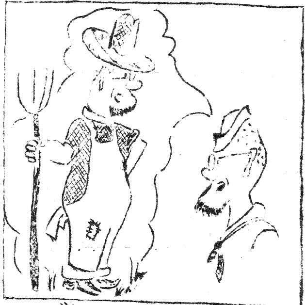
"41 POINTS - WHOW"

For those men desiring further information on any points of interest concerning demobilization, "shipping over", and discharge, a question box has been provided in ship's office. Please drop any questions you may have therein; and the "Nameless News" will attempt to answer them.