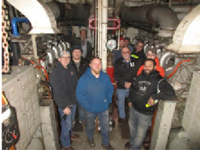
4-13-17 Operating Engineers in engine room.JPG 5176K