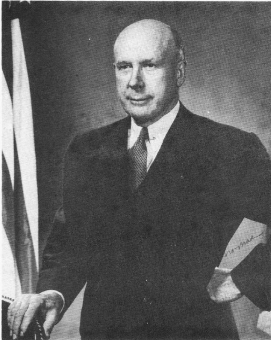
THE HONORABLE CHARLES S. THOMAS Secretary of the Navy