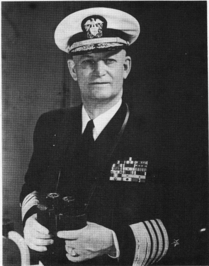
ADMIRAL ARLIEGH A. BURKE, USN Chief of Naval Operations