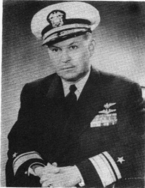
REAR ADMIRAL HUGH H. GOODWIN, USN Commander, Naval Forces Continental Air Defense Command