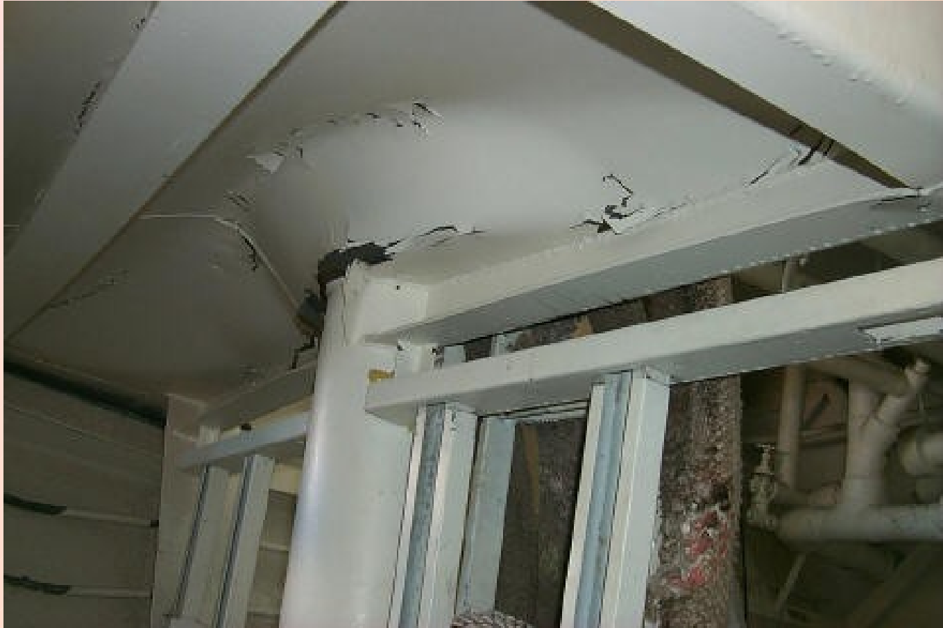
SD STOREROOM 3-10-1-A