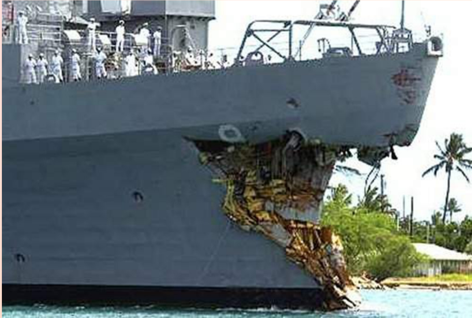
USS DENVER ARRIVING AT PHNS&IMF ON 14 JULY 00