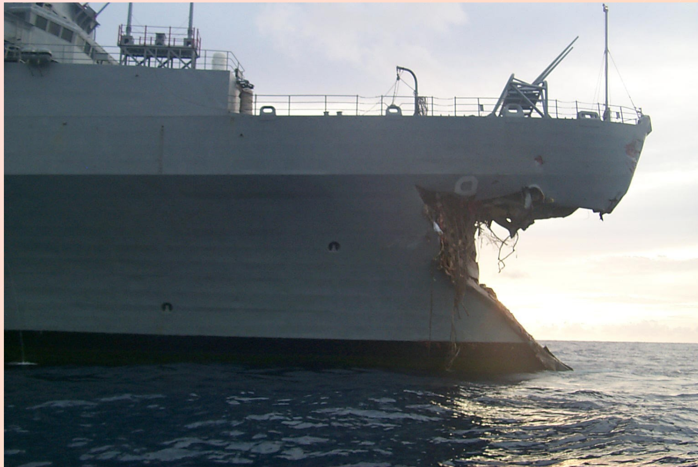
BOW SECTION - STBD SIDE PROFILE