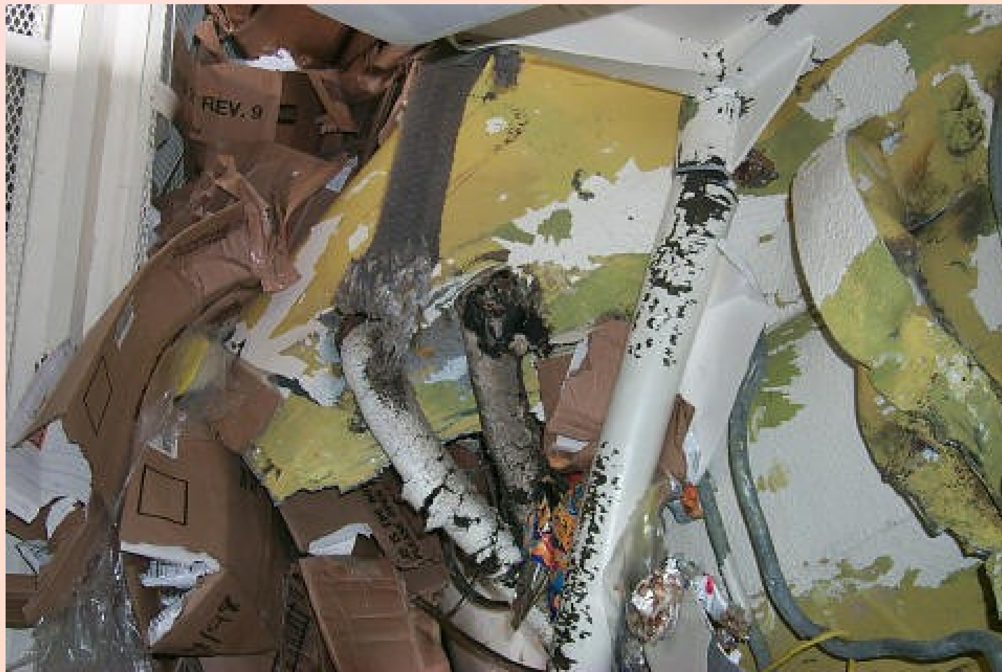
SD STOREROOM 3-10-1-A THIRD DECK - LOOKING FWD