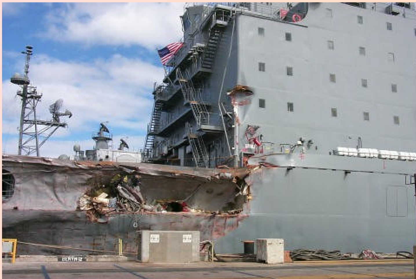
USNS YUKON DAMAGE