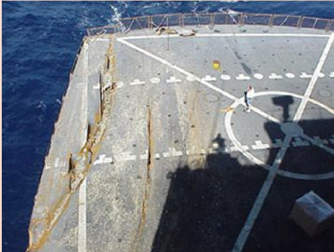
USNS YUKON DAMAGE