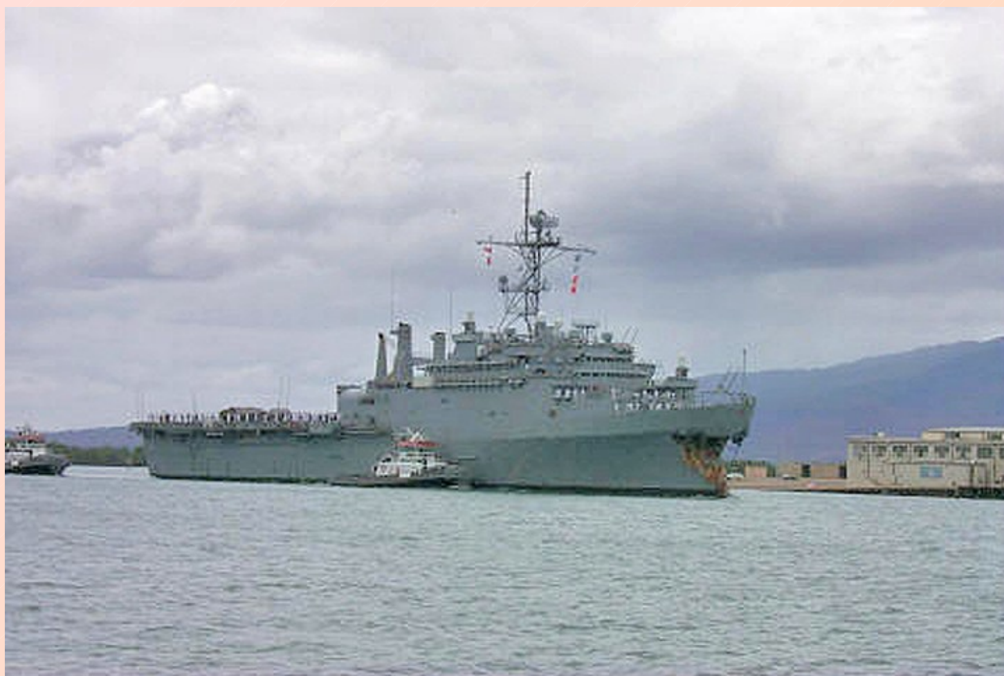
USS DENVER ARRIVING AT PHNS&IMF ON 14 JULY 00