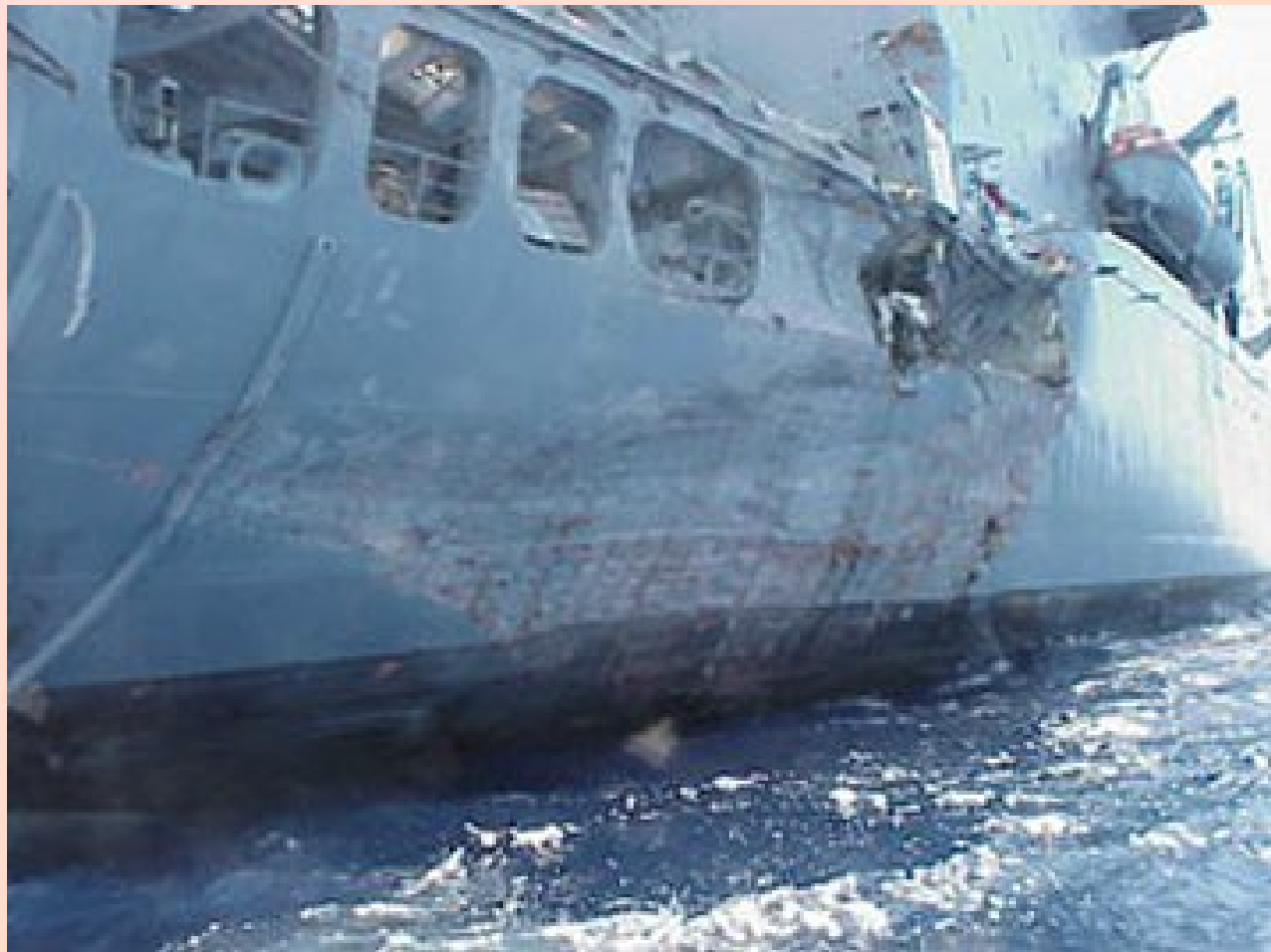
USNS YUKON DAMAGE