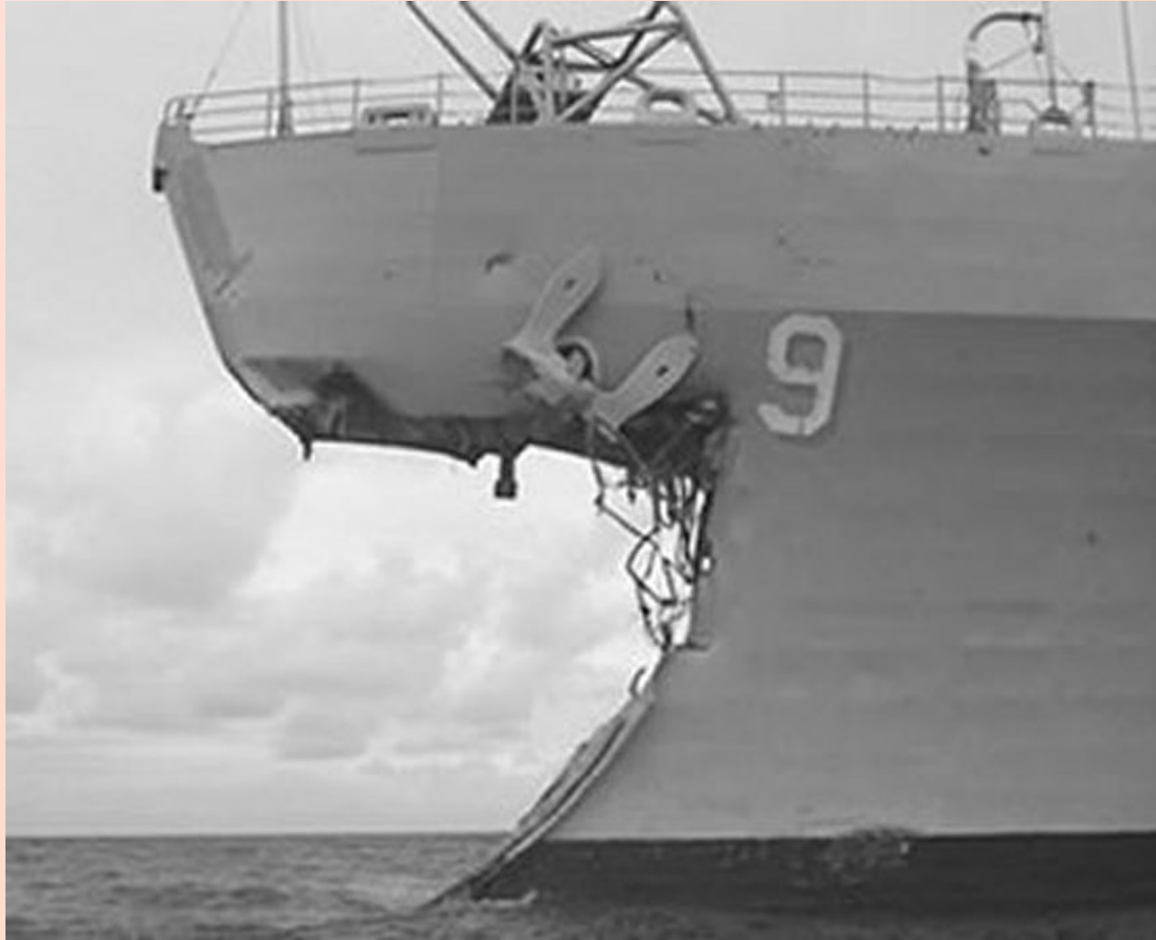
BOW SECTION - PORT SIDE PROFILE