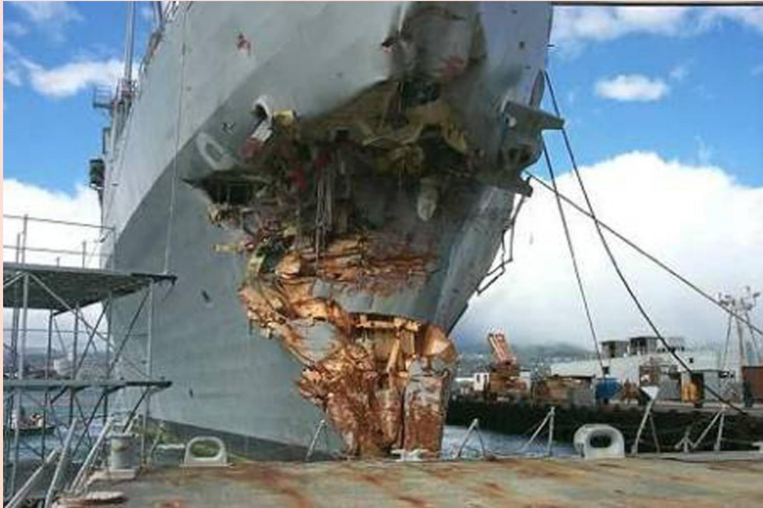
BOW SECTION - STBD SIDE