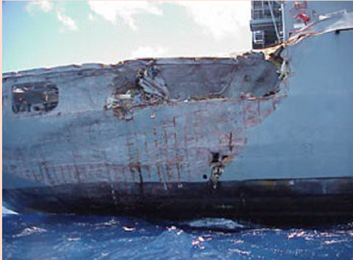
USNS YUKON DAMAGE