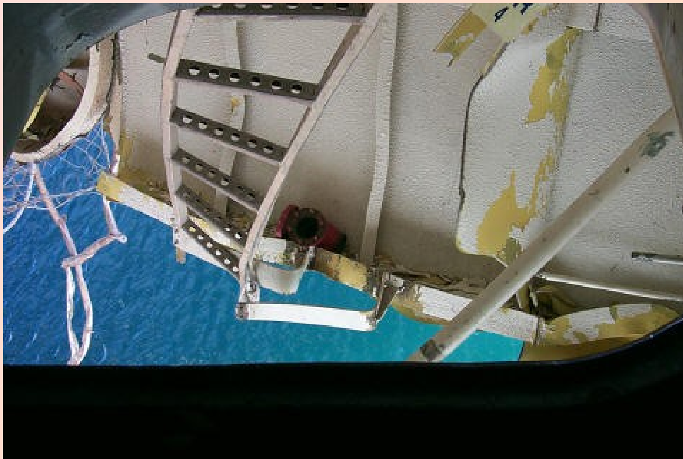
BOS'N STOREROOM 2-E-O-A SECOND DECK