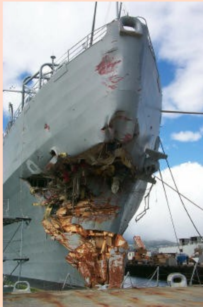
BOW SECTION - STBD SIDE