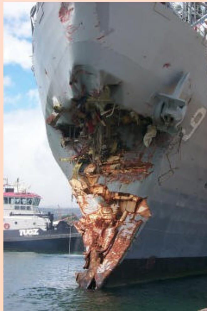
VIEWS OF BOW DAMAGE - PORT SIDE VIEW