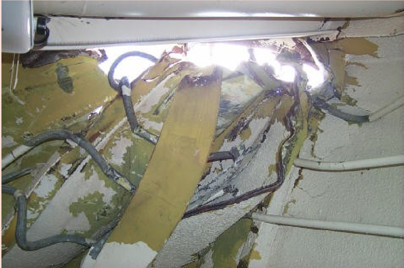
SD STOREROOM 3-10-1-A THIRD DECK - LOOKING FWD