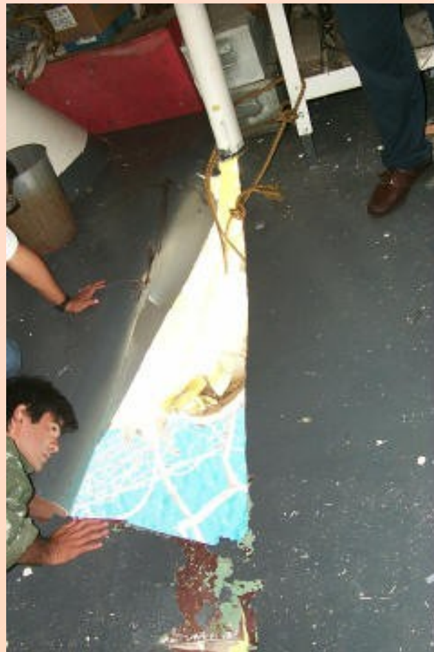
BOS'N STOREROOM 2-E-O-A SECOND DECK