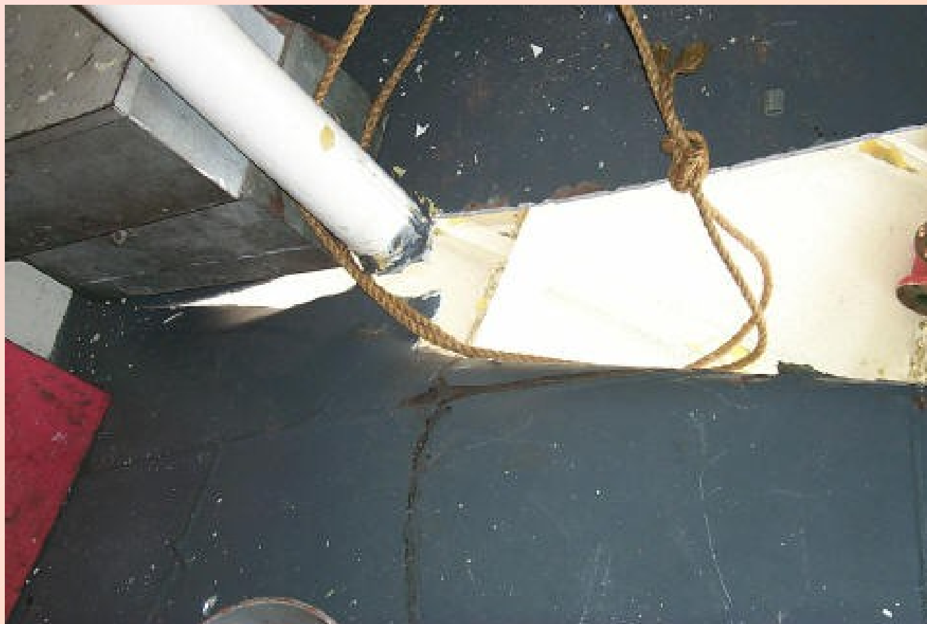
BOS'N STOREROOM 2-E-O-A SECOND DECK