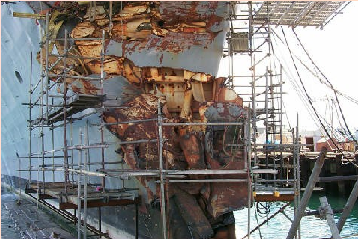
CLOSE UP OF STAGING BELOW