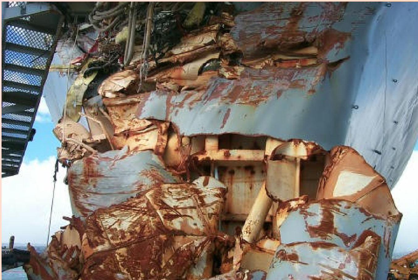
BOW SECTION THIRD AND FOURTH DECK