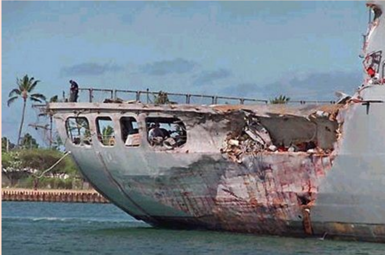
USNS YUKON DAMAGE