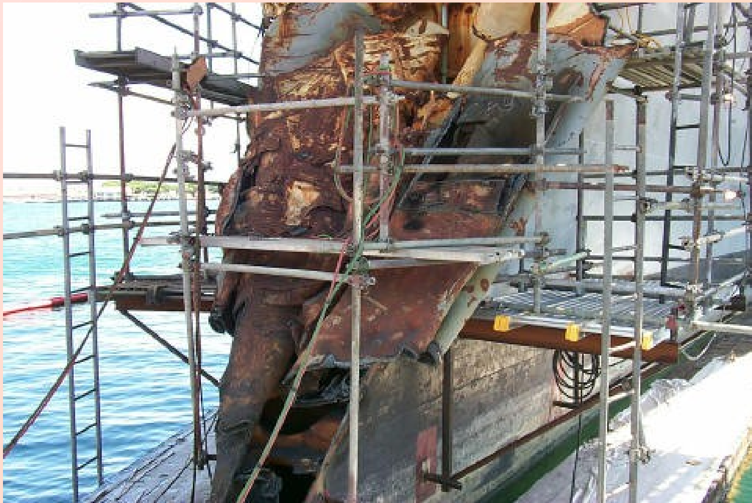
LOWER STAGING DETAILS