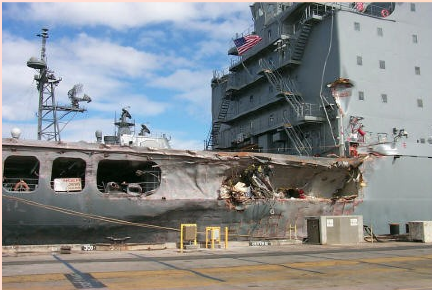
USNS YUKON DAMAGE