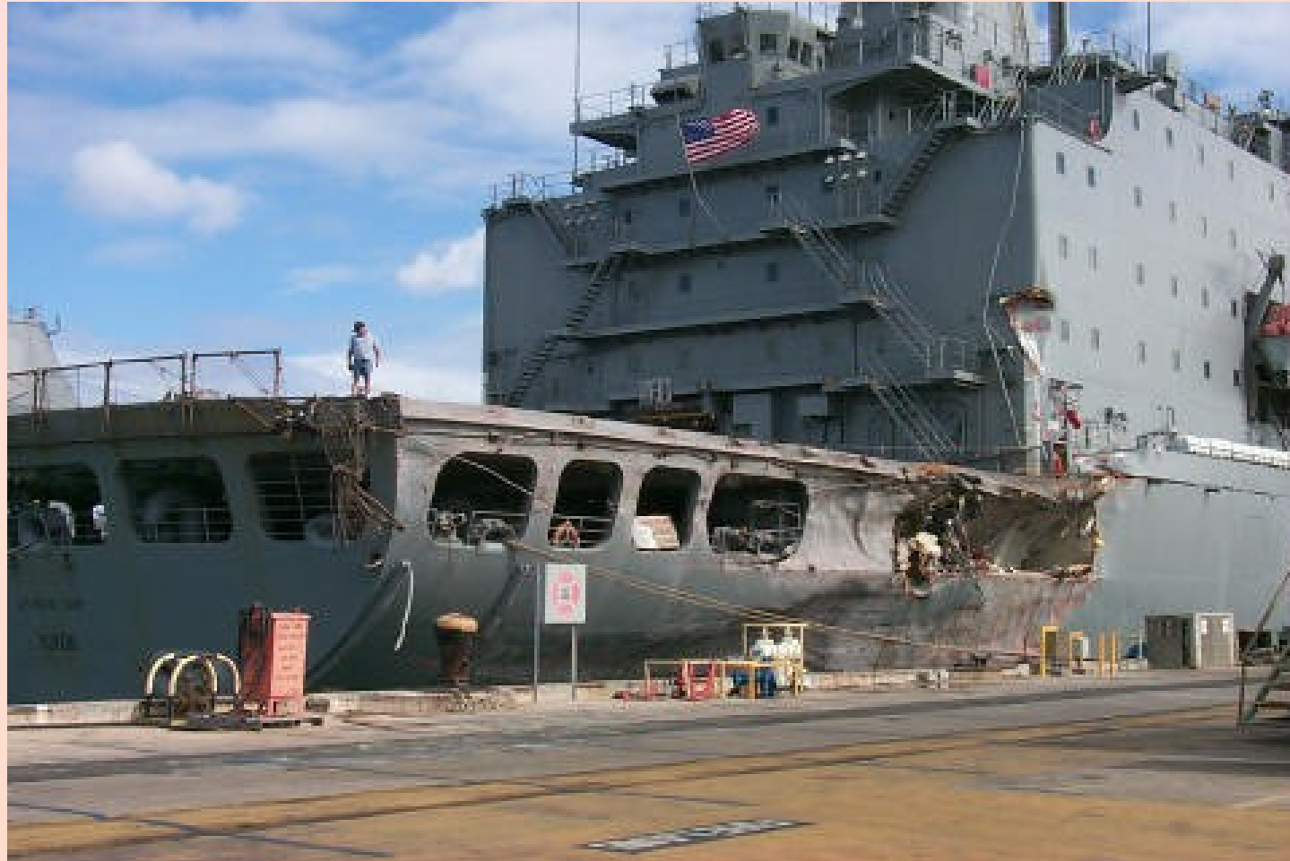
USNS YUKON DAMAGE