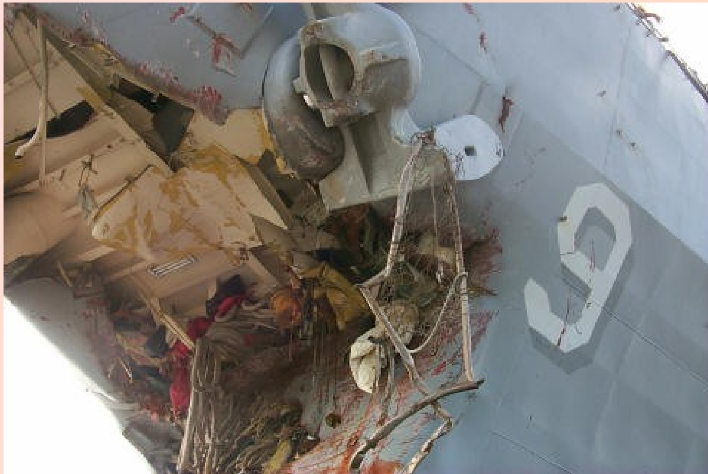
BOW SECTION - PORT SIDE LOOKING UP TO THE BOTTOM OF SECOND DECK