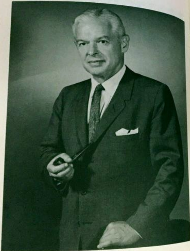
THE HONORABLE PAUL H. NITZE Secretary of the Navy