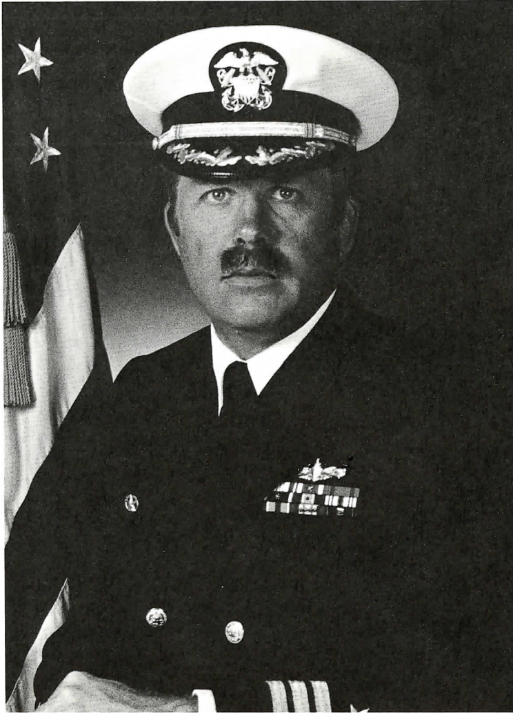
COMMANDER JOSEPH B. WILKINSON UNITED STATES NAVY Commanding Officer, USS BARBOUR COUNTY (LST 1195)