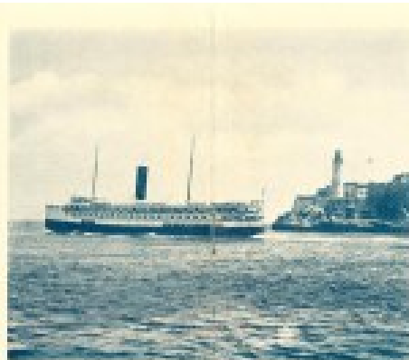
S. S. GOVERNOR COBB