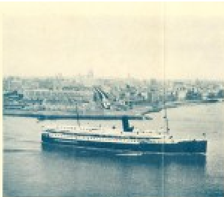
S. S. CUBA