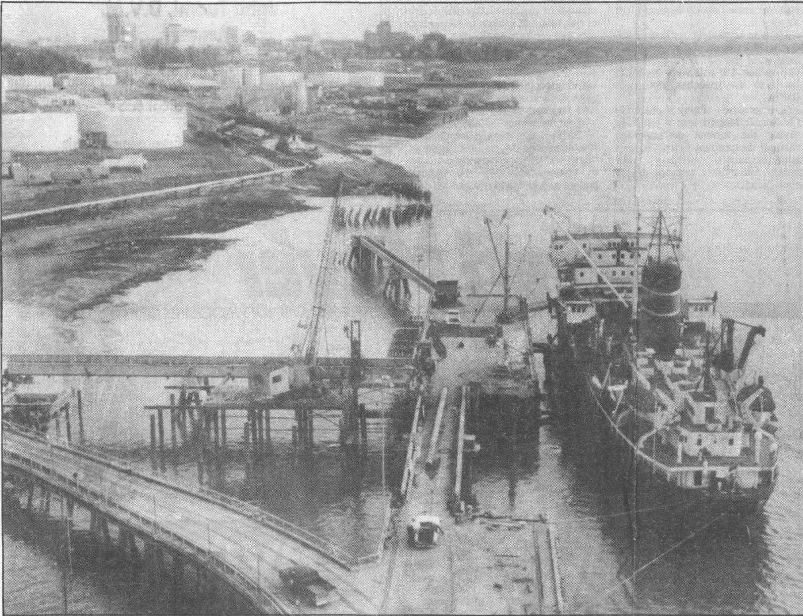
The U.S. Corps of Engineers' hopper dredge Biddle, due in Anchorage tonight, sits at the Anchorage port on an earlier working visit in 1975